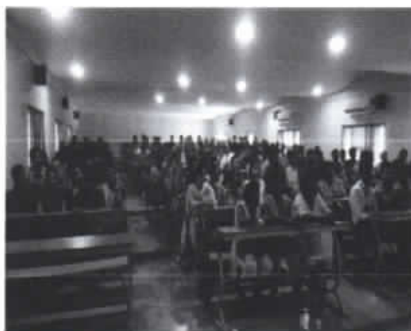
(Gathering of students)