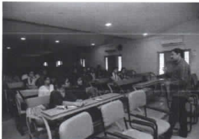
(Mr. B. Eshwar Rao, VITS, Vizag training students)

45 students from various branches participated in this training.